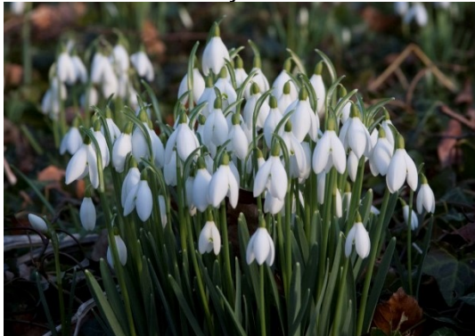
Snowdrop Walk Charity Day: Saturday 17 February

Admission includes entry to the Shirehall Museum